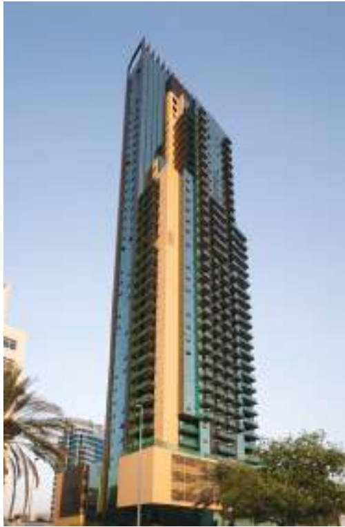
The Square Tower