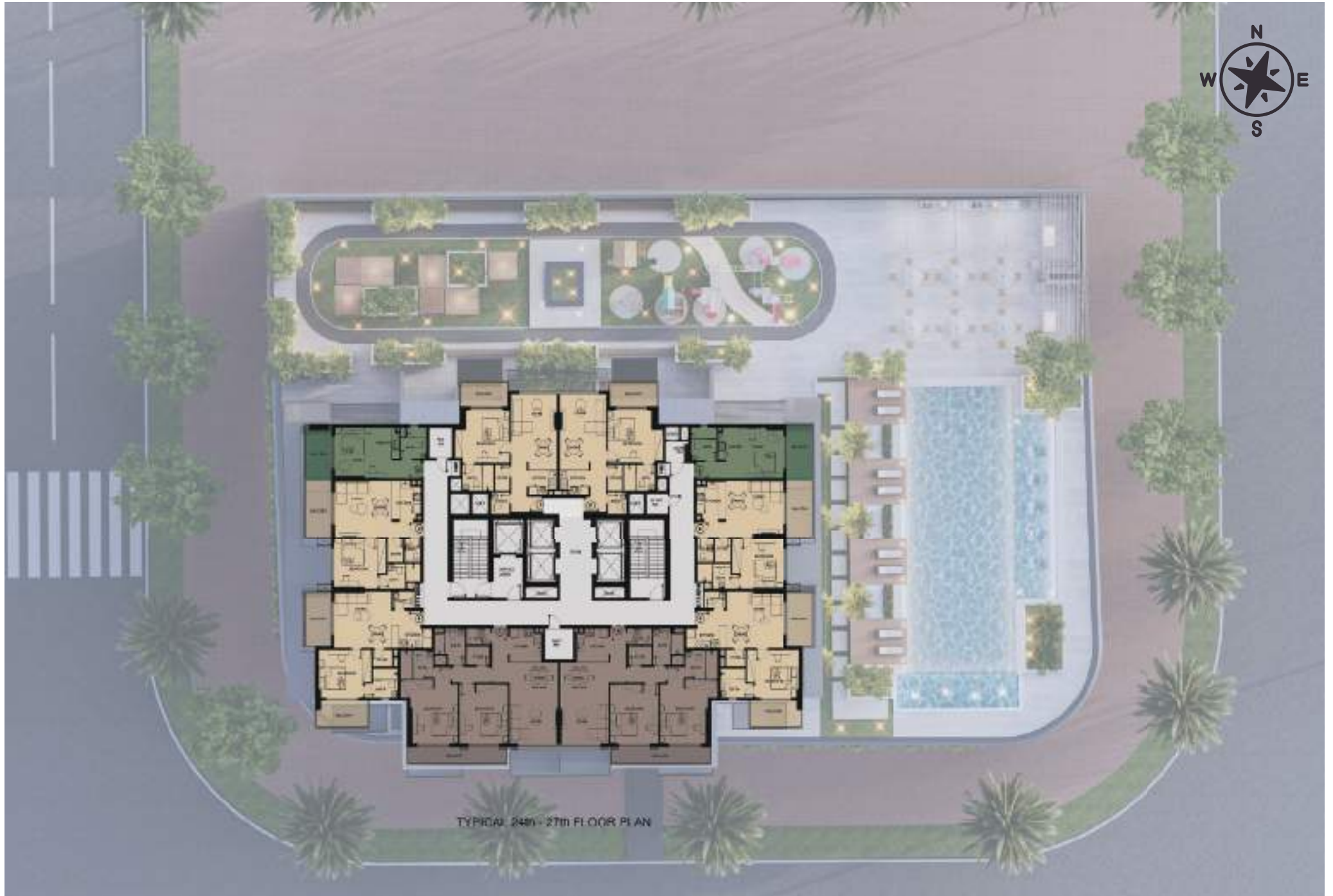
TYPICAL 24th - 27th FLOOR PLAN