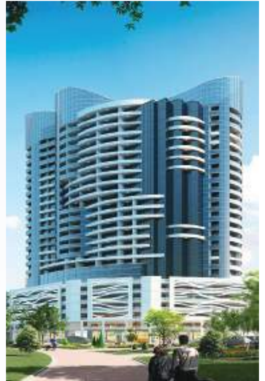
Blue Waves Tower