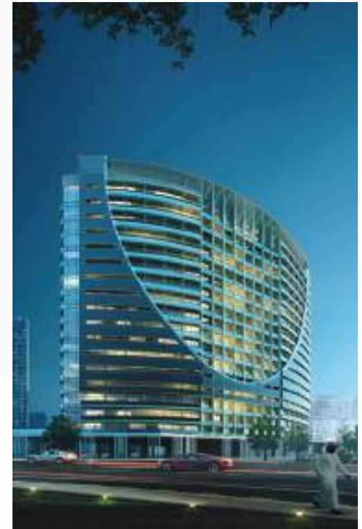
The V Tower